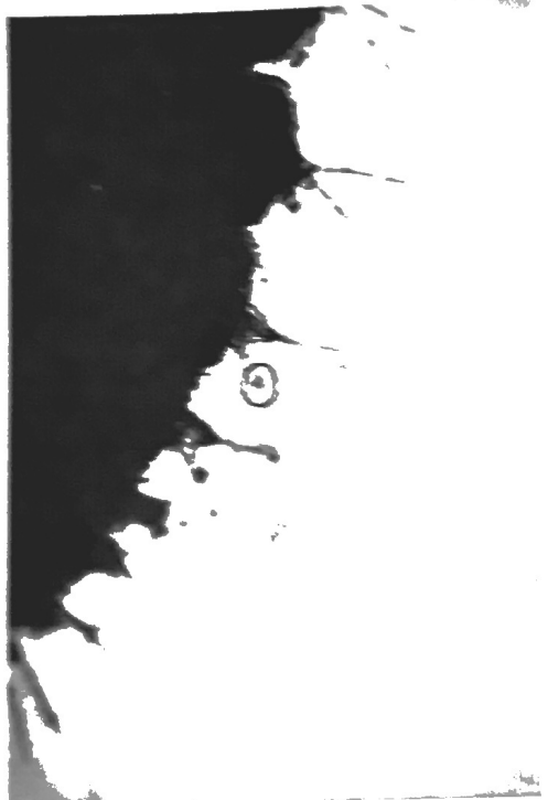
Fig. 2. Larval Clonostomum , seen with spine-like projections at anterior extremity (taken at 200x).

In October 1967 a sample from Tennessee River mile 286.6, Wheeler Reservoir, Alabama, revealed six specimens of Clonostomum avellanis (Hagen) larvae. The largest specimen was 4 mm in length. Specimens were found on colonies of Spongilla sp. On November 15, 1967, a specimen of Clonostomum avellanis was collected at Clinch River, mile 44.3, Tennessee, from Spongilla sp. These are the only locality records known for Sisomidae in the Tennessee River drainage.