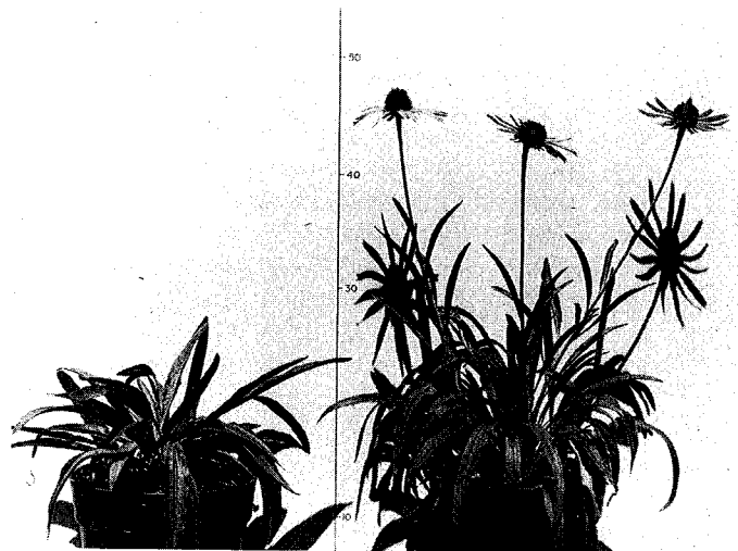
FIG. 3. Effect of photoperiod on flowering of Echinacea tennesseensis . Nonflowering plant on left was grown under a short-day photoperiod and flowering plant on right under a long-day photoperiod. Scale is in centimeters. Photograph was taken on 18 May 1979.

Hemmerly (1976) reported that insect visitation was necessary for seed set in E. tennesseensis . Plants that flowered in our study did not set seeds; no insects were observed visiting the plants in the growth chambers or greenhouses. McGregor (1968) reported that all other taxa of Echinacea are self-sterile and that it was relatively easy to do crossing experiments by rubbing flowering heads of the different taxa together. Thus, one should be able to cause seed set in E. tennesseensis by rubbing flowering heads of different plants together.