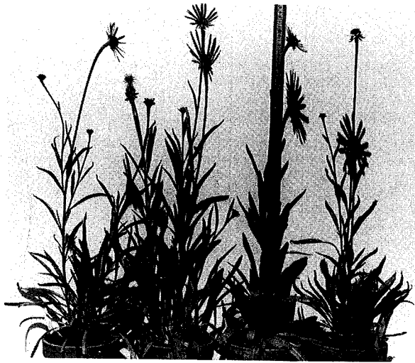
FIG. 1. Flowering of vernalized and nonvernalized plants of Echinacea tennesseensis . From left to right, plants were moved from the nonheated to the heated greenhouse on 17 September 1977, 1 December 1977, 1 January 1978 and 15 February 1978. Photograph was taken 7 June 1978.