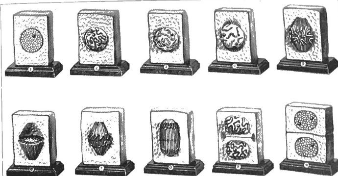
JM-321 Plant Mitosis

This set of ten models showing Plant Mitosis as it transpires in the onion root, was prepared at the request of numerous teachers and is now widely used in schools throughout the country. The various steps in mitosis, from the resting stage to the newly formed daughter cells, are brought out by sculpturing the nuclei, spindles, etc., from the background in full relief and by coloring.